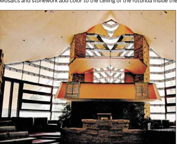
The Unitarian Meeting House in Madison was designed by Frank Lloyd Wright and is open for tours. Other Wright works are near the capital.

bar has free samples, along with chutneys, salsas, sauces and preserves. The gift shop stocks wacky mustard-themed items, as well as 300 to 400 mustards.