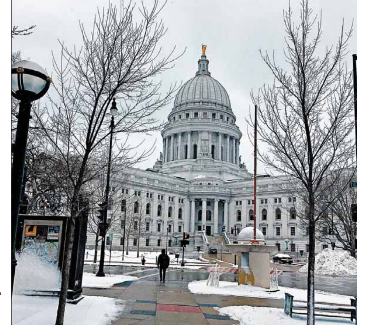
Wisconsin's Capitol building was completed in 1917 and dominates the skyline in downtown Madison.

Downstairs, the free museum displays rack after rack of mustards, along with antique mustard pots, advertisements and other memorabilia. Upstairs, a tasting